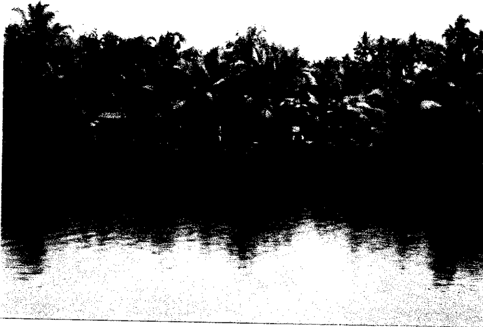
← A view of the fish farm at Veluthulli Lake, Alappuzha