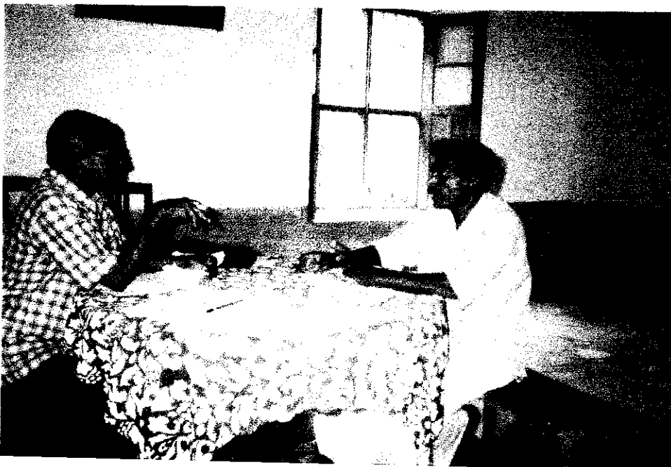
← Dialogue with another Interlocutor at Trivandrum