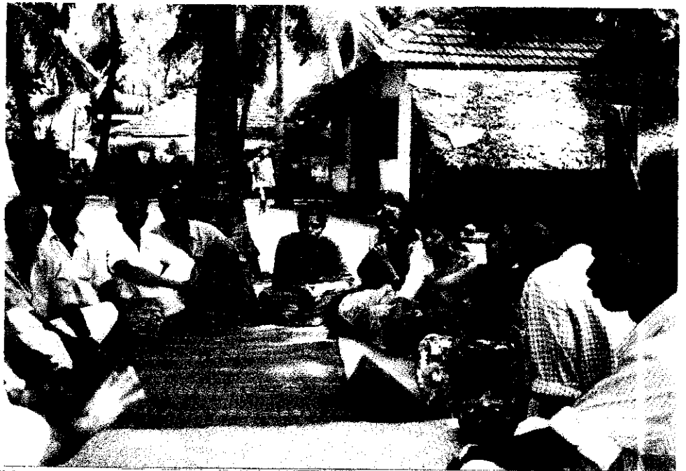
Focus group discussion with a section of inland fishworkers, Alappuzha →