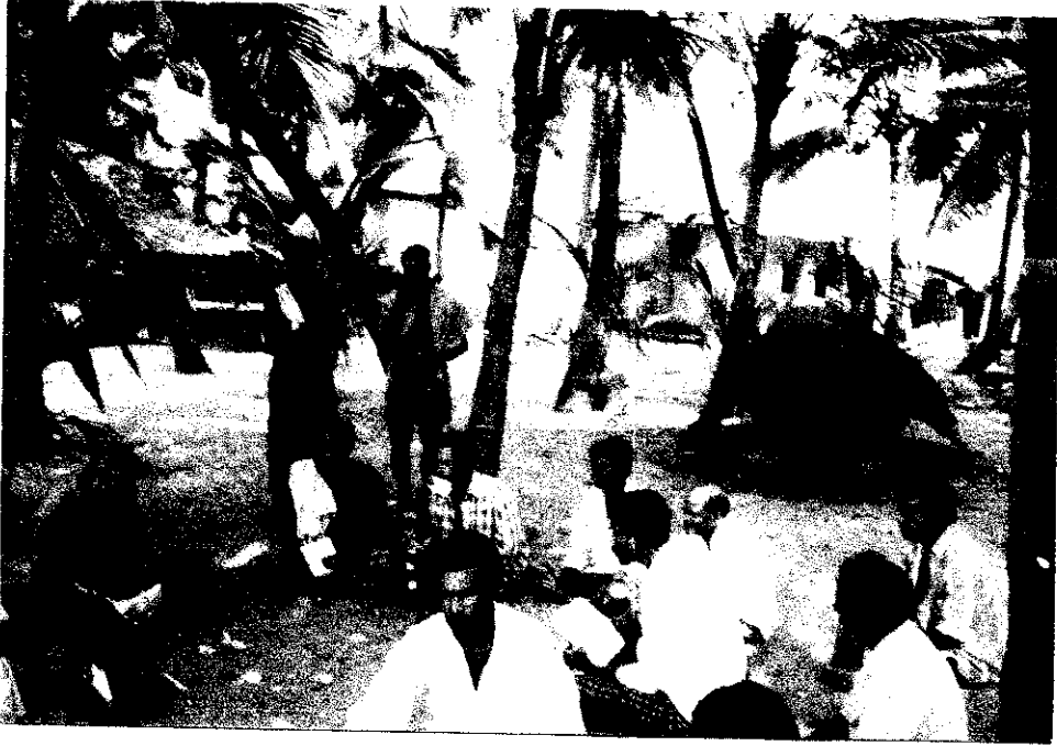
← A focus group discussion in a fishing hamlet in Trivandrum