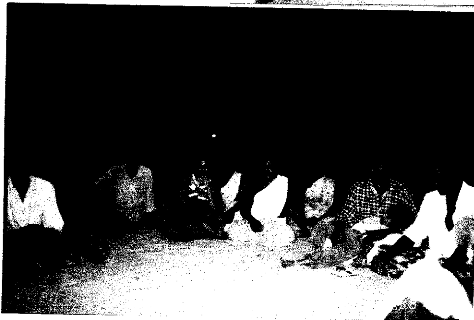
← Group discussion with marine fish workers, beach ward, Alappuzha